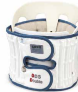
PDAC L0637/LO650 DDS DOUBLE