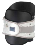
PDAC L0639/LO651 DDS 500-639