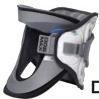
DDS MAX *One size fits most