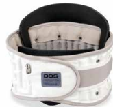
PDAC L0631/LO648 DDS 500